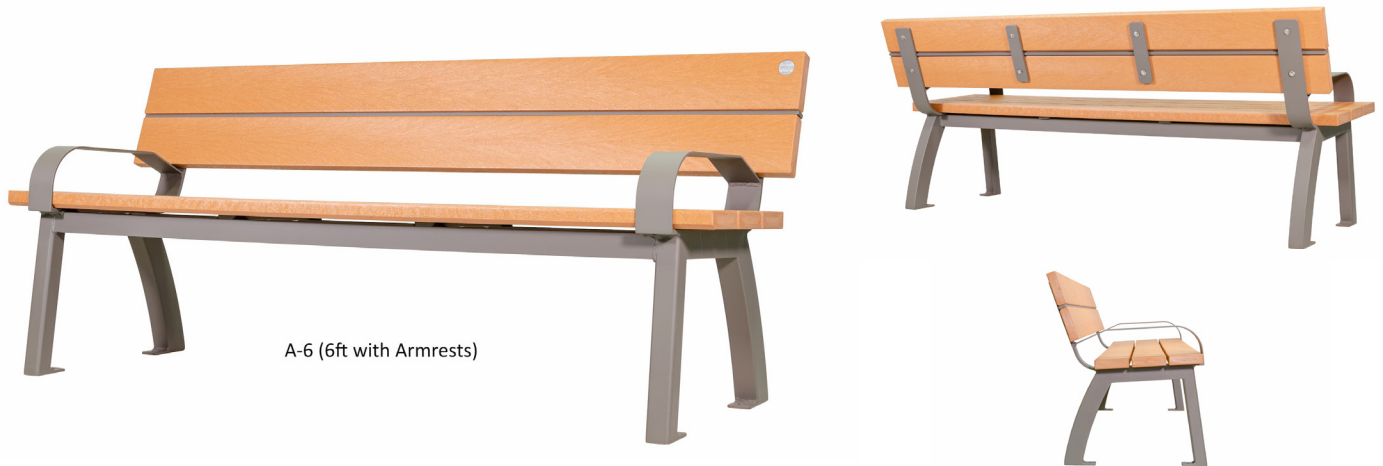
A-6 (6ft with Armrests)

ANA-6 (6 ft without armrests) ANA-5 (5 ft without armrests) A-6 (6 ft with armrests) A-5 (5 ft with armrests)